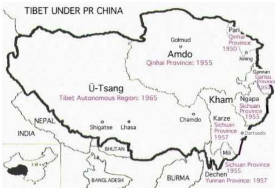
Map: Administrative division of Tibet by CCP